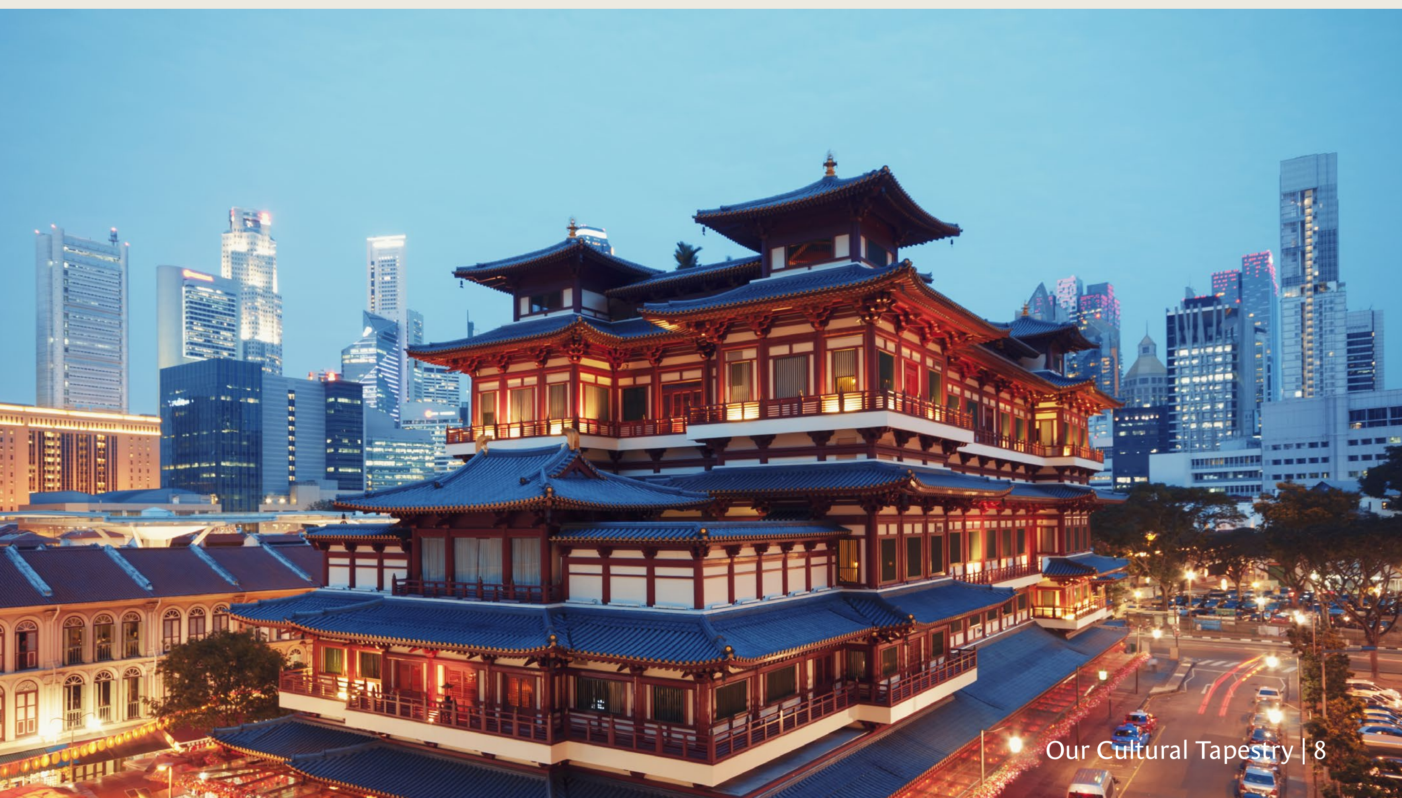
Photo Ideas: Snap photos of Chinese lanterns hanging across the streets, traditional shophouses, Buddha Tooth Relic Temple, Sri Mariamman Temple and Jamae Mosque

Explore: Walk through Chinatown area filled with temples and street markets. Visit iconic landmarks like the Buddha Tooth Relic Temple, explore the vibrant street food stalls, and discover traditional shophouses that transport you to a bygone era.