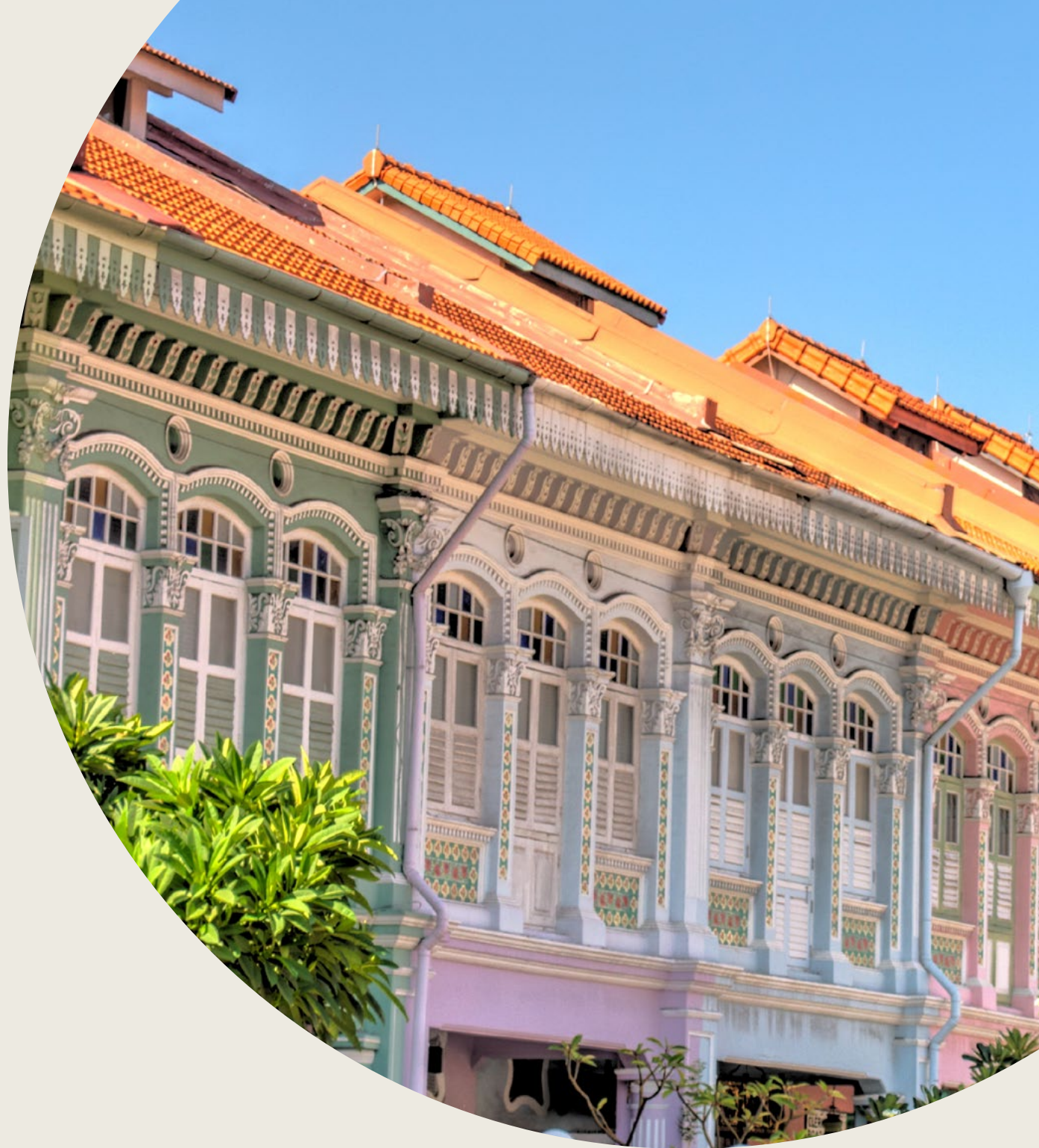
Photo Ideas: Capture vibrant shophouses, detailed Peranakan motifs, and lively heritage streets.

Explore: The Peranakan culture, a fusion of Chinese and Malay traditions, comes to life in the colourful streets of Katong and Joo Chiat. Admire pastel-coloured shophouses, intricate Peranakan tiles, and savour in authentic Peranakan cuisine.