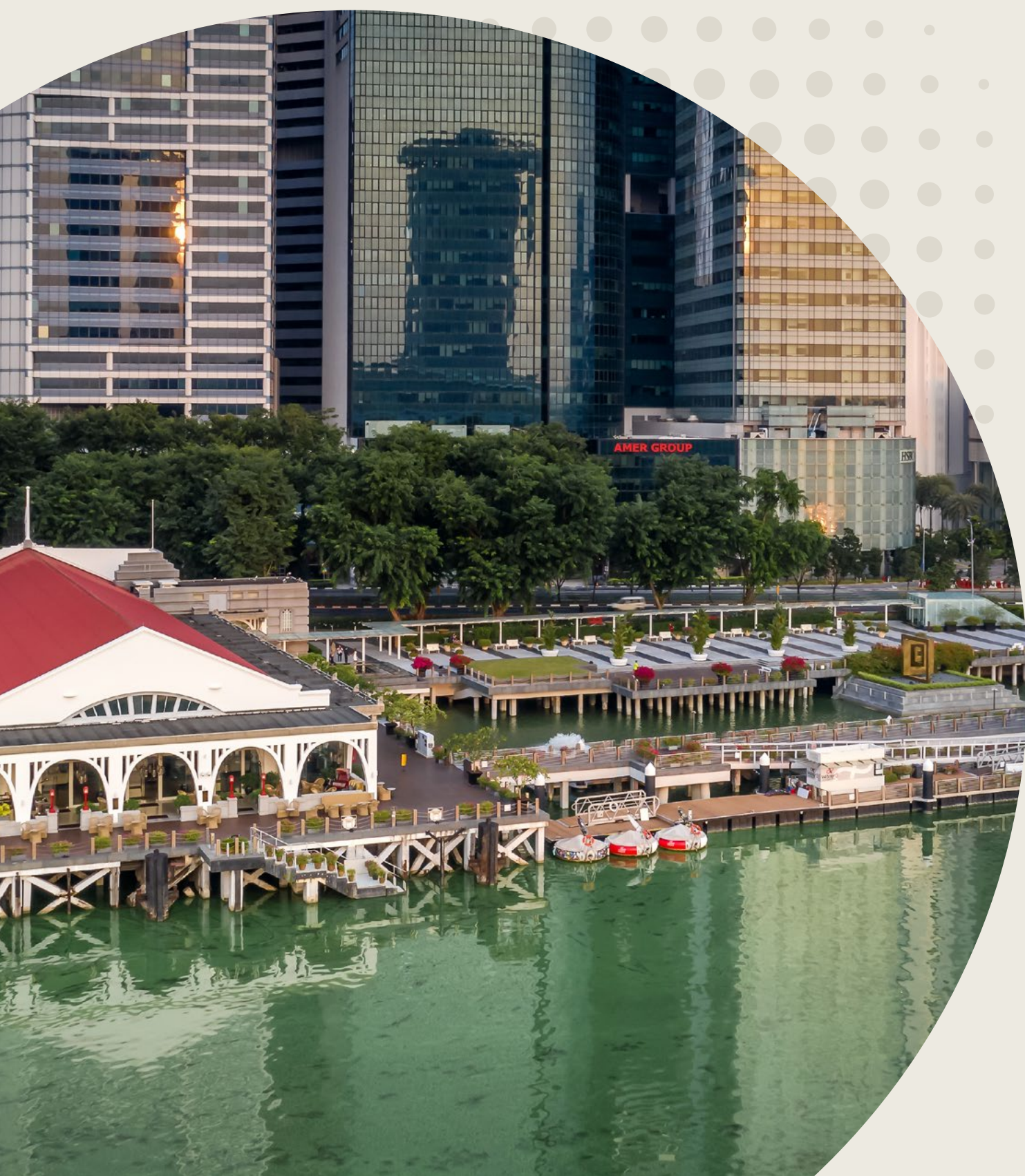
Photo Ideas: No visit to Singapore is complete without stopping at Merlion Park, where the iconic Merlion spouts water into Marina Bay, symbolising the nation’s fishing village origins.

Admire: Stunning waterfront views with Marina Bay Sands and iconic buildings surrounding the area. Be sure to spot the red lamp at Clifford Pier, a historic symbol of Singapore’s maritime heritage and colonial past.